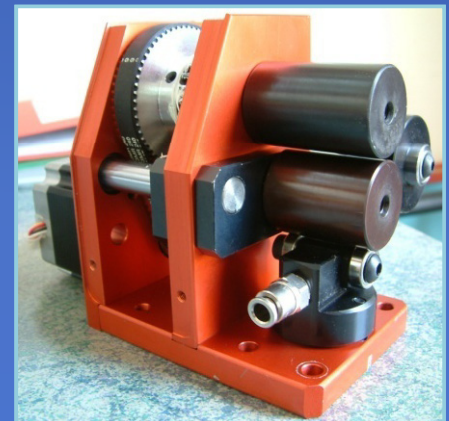
Digital Roll Feeder

We Turn any Manufacturing Challenge to Quality and Working Solution.